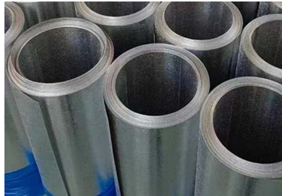
Stucco Embossed Aluminum Jacketing Coil