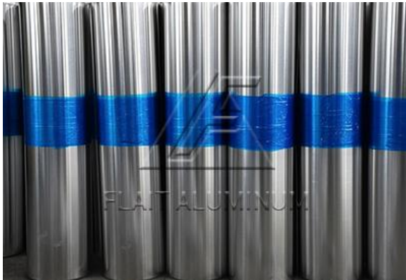
Mill Smooth Aluminum Jacketing Insulation Coil